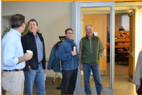
Chapter members gathering in the Wishcamper Center Atrium before the meeting.