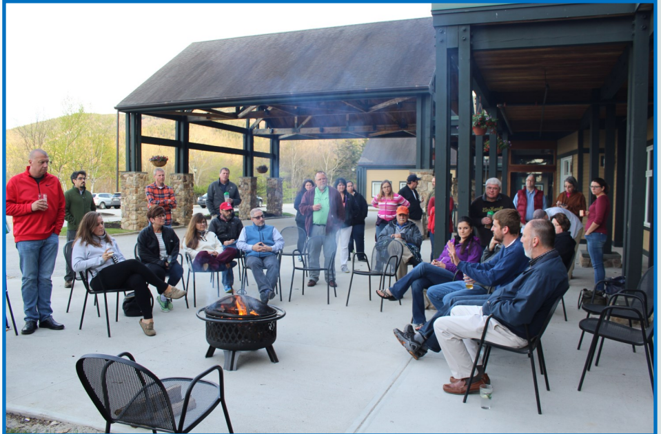
Maine Chapter Meeting