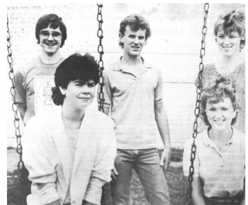
HHS council officers

My favorite conference memory was my opportunity to speak on community engagement at my session, “ Making Community Connections ”. I grew up 250 miles south of Chicago and in May 1986, I was lucky enough to travel there for the annual state convention for the Illinois Association of Student Councils. I remember watching with admiration as those student leaders presented ideas with confidence and conviction. At their closing gala, I silently vowed that someday I was going to come back to Chicago to present about something that I am truly passionate about. Now, 35 years later, I still have the original newspaper clipping as evidence that it is never too late to keep a promise to yourself!